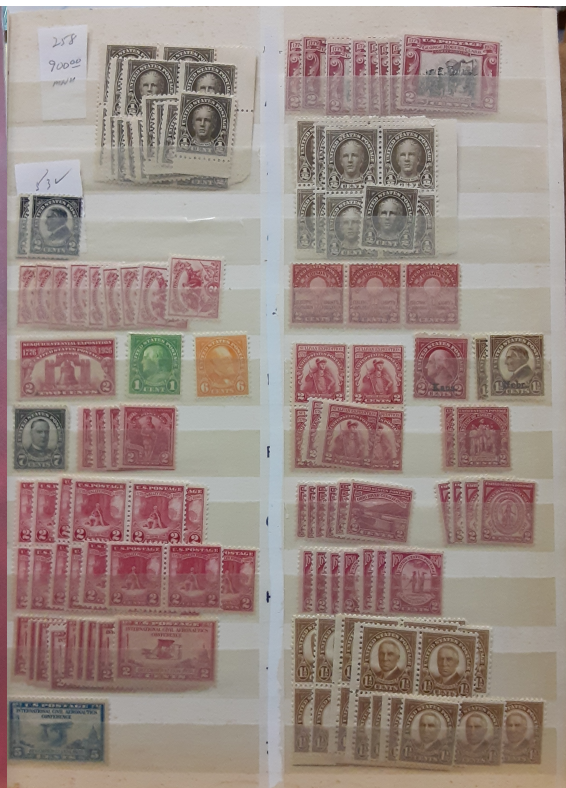
US Mint Stamps in Stock Book LOT 119 CV$265 Opening Bid $30