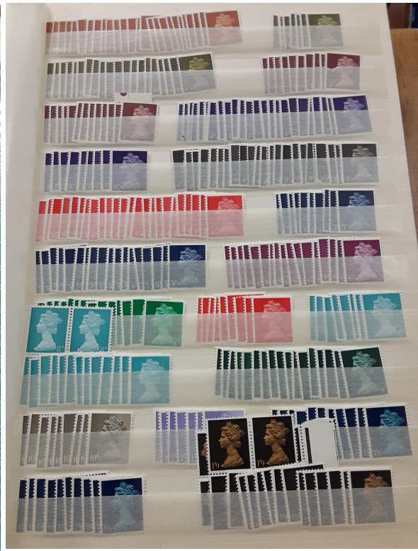
Great Britain Machins in Sock Book LOT 118 Opening Bid $30