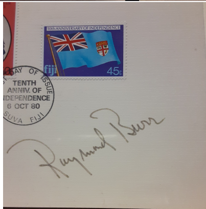
Fleetwood Fiji Folder Signed by Raymond Burr LOT 120 Starting Bid $20